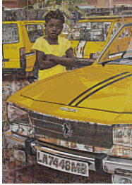
NJIDEKA AKUNYILI CROSBY "The Beautiful Ones" Series #7

2018 Acrylic, colored pencil and transfers on paper 59 7/8 x 41 1/2 inches (152.1 x 105.4 cm)