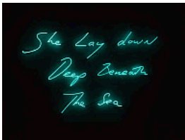
TRACY EMIN She Lay Down Deep Beneath the Sea

Acquired through the generosity of Fotene Demoulas and Tom Coté 2019.08