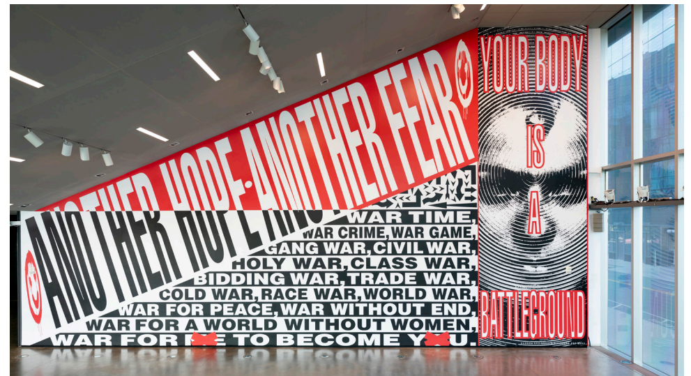
Barbara Kruger, Untitled (Hope/Fear) , 2022. Installation view, Barbara Kruger, the Institute of Contemporary Art/Boston, 2022–24.