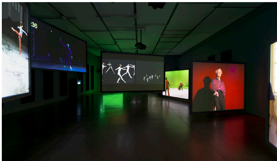
Charles Atlas, MC 9 , 2012. Installation view, Charles Atlas: About Time , the Institute of Contemporary Art/Boston, 2024–25.