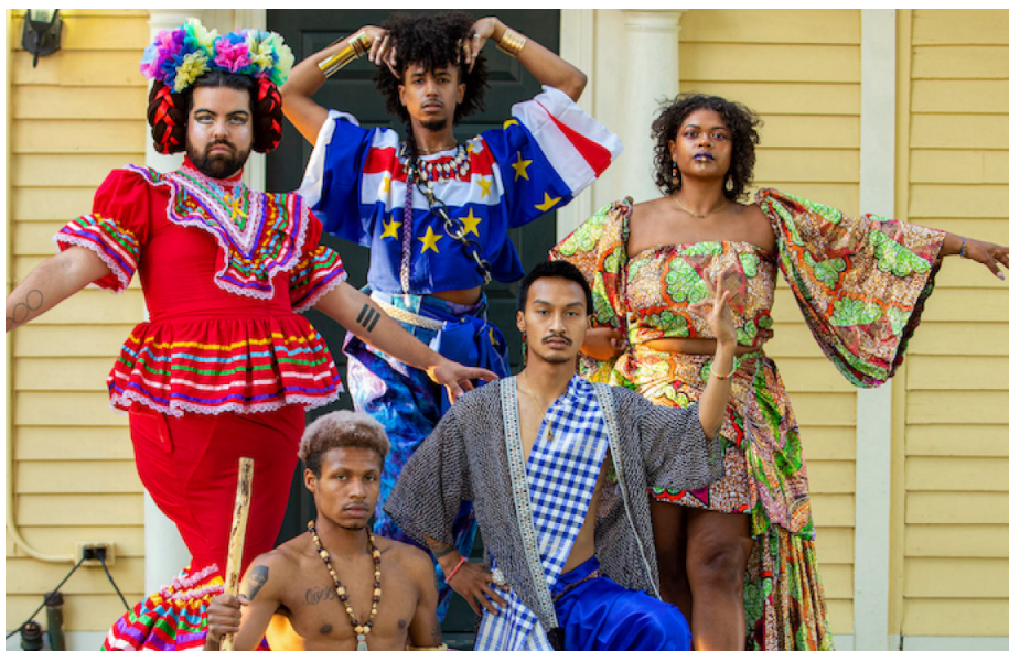
The Haus of Glitter.