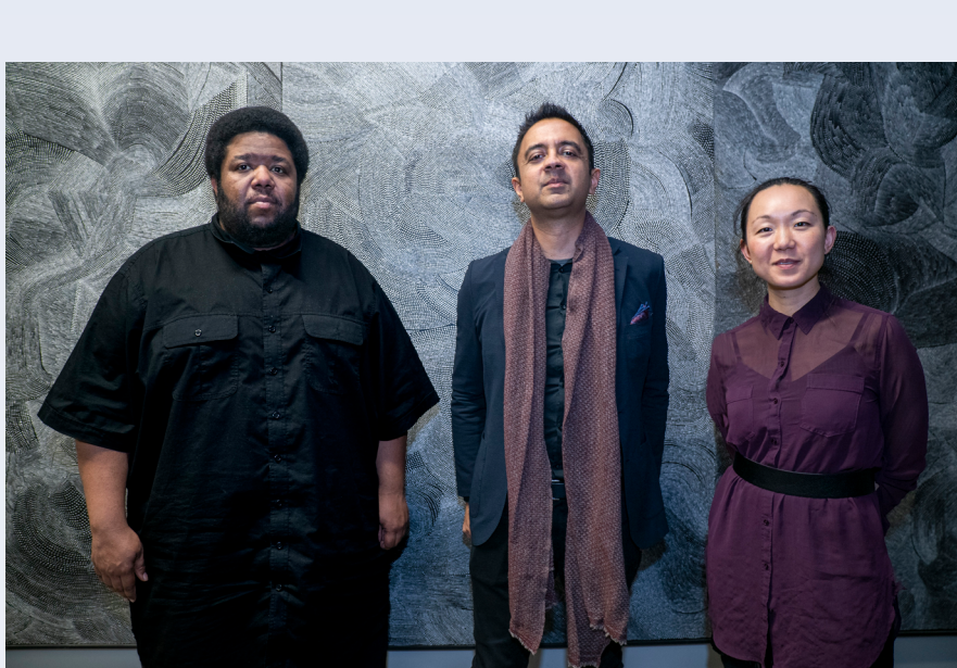
Tyshawn Sorey, Vijay Iyer, and Linda May Han Oh.