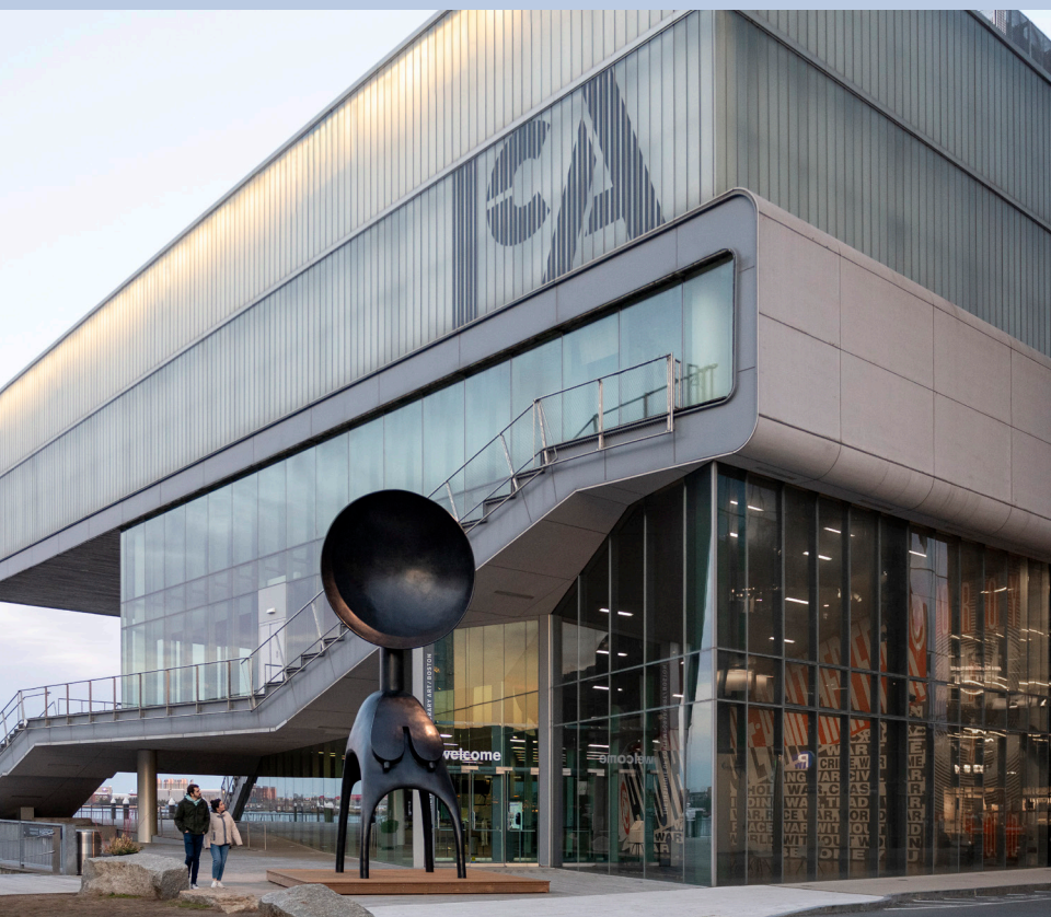
Simone Leigh, Satellite , 2022. Bronze, 24 feet x 10 feet x 7 feet 7 inches (7.3 x 3 x 2.3 m). Courtesy the artist and Matthew Marks Gallery. Photo by Timothy Schenck. © Simone Leigh