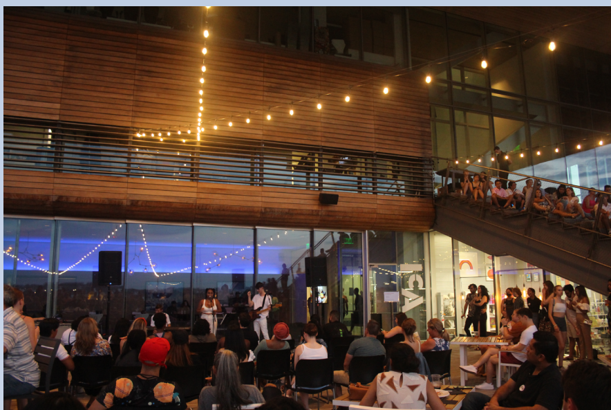
Eph See at Summer Sessions.