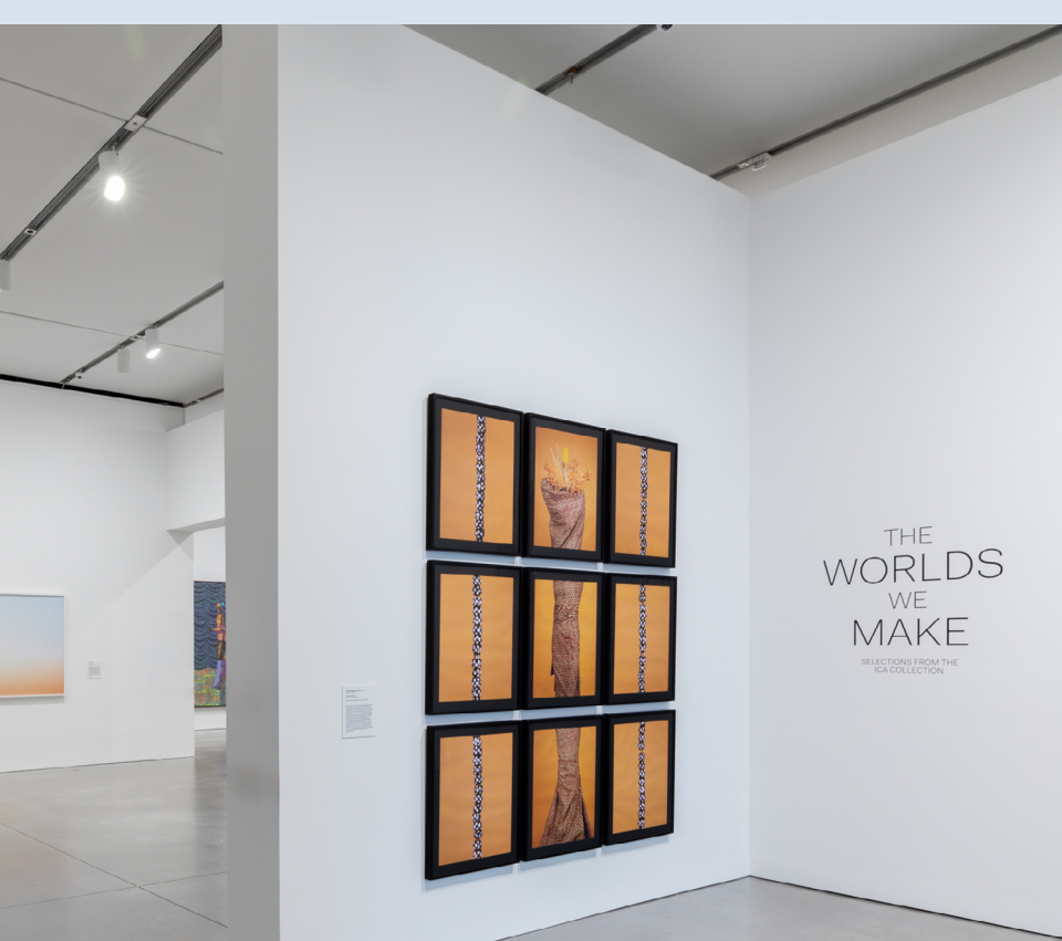
Installation view, The Worlds We Make: Selections from the ICA Collection , the Institute of Contemporary Art/Boston, 2021–22.