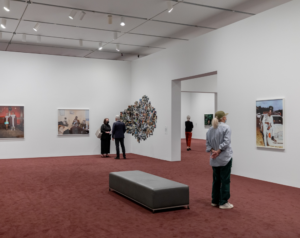
Installation View of Deana Lawson