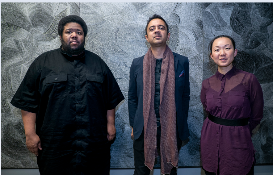
Tyshawn Sorey, Vijay Iyer, and Linda May Han Oh.